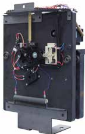
Figure 3. QD3 Quik-Drive tap-changer

The load tap-changer product offering from Eaton's Cooper Power series consists of three Quik-Drive™ tap-changers, the most advanced tap-changers in the industry. Each device is sized for a specific range of current and voltage applications and share many similarities in their construction. The primary benefits of Quik-Drive tap-changers are: direct motor drive for simplicity and reliability; high-speed tap selection for quicker serviceability; and proven mechanical life (one million operations). Common Quik-Drive tap-changer features include: neutral light switch; position indicator drive; safety switches; and logic switches (back-off switches). Quik-Drive load tap-changers meet IEEE® and IEC standards for mechanical, electrical and thermal performance.