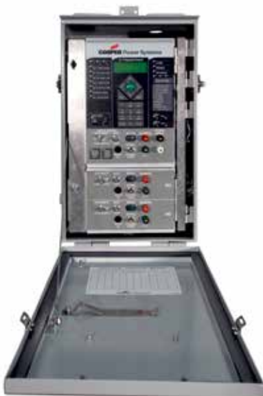
Figure 2. CL-7 Control.