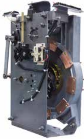
Figure 4. QD5 Quik-Drive tap-changer