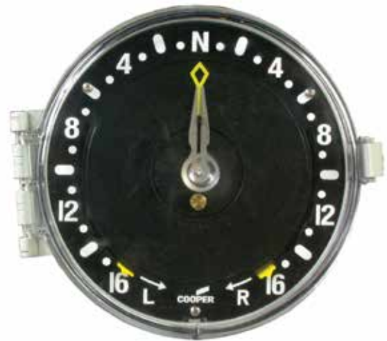
Figure 6. Position Indicator.

The five possible load current ratings associated with the reduced regulation ranges are summarized in Tables 4 and 5. At each setting, a detent stop provides positive adjustment. Settings other than those with stops are not recommended. The raise and lower limits need not be the same value except for locations where reverse power flow is possible.