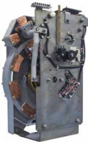
Figure 5. QD8 Quik-Drive tap-changer